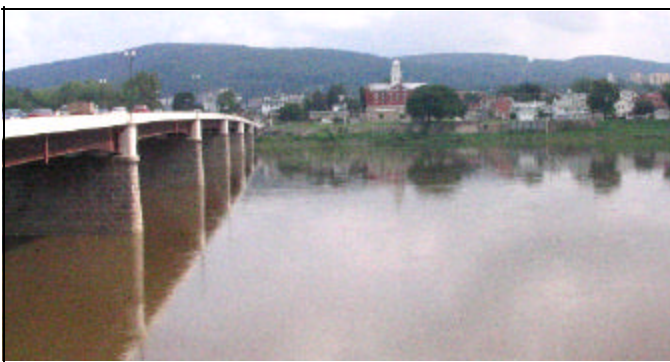
Above: The Susquehanna River was once congested with travelers and commerce. Right: Danville's former train station has been preserved as a garden/craft shop.