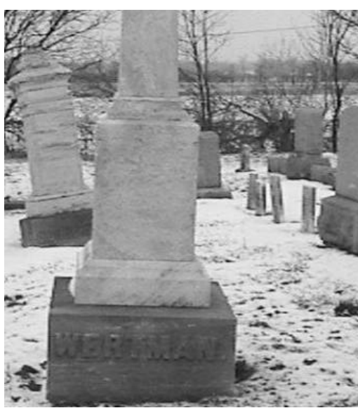
Wertman stones in the Stahler and Sheaffer cemeteries, Lockport.