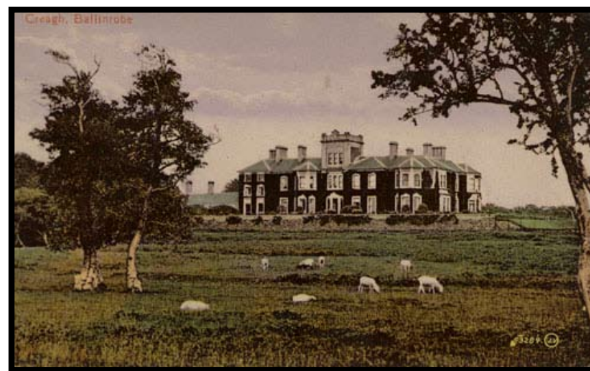
Creagh Estate in the barony of Kilmain, Co. Mayo.

Ballinrobe is situated on the River Robe at the heart of the lake district of South Mayo. Ballinrobe Castle was located where the ruins of Cavalry Barracks stand.