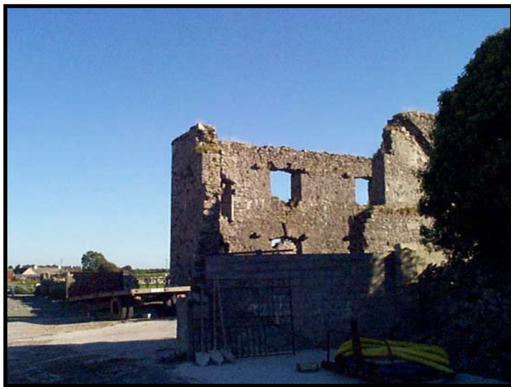
CARROWBROWNE (QWAROWN BROWNE) CASTLE

Carrow Browne was an early 14th century hall-house on the northern outskirts of the town of Galway