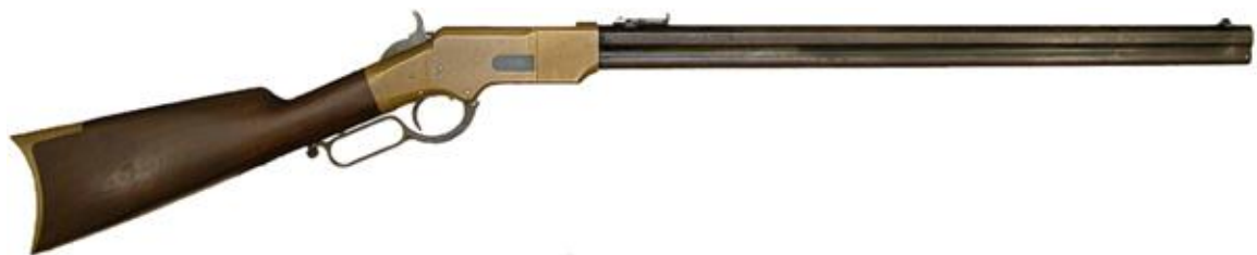
Rare Winchester Society photograph [9]: Traditional Henry rifle Model 1866.