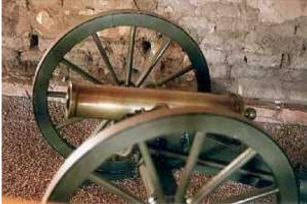
U.S. National Park Service photograph [15]: 12-Pound Mountain Howitzer

post 4 feet high at nearly a quarter of a mile with a bomb [shell]. Bankhead's howitzers were not fired in the relief of Beecher Island.