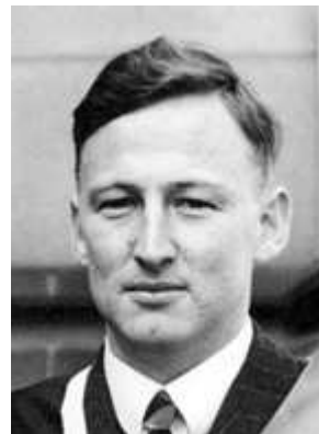
Participant in 1949.