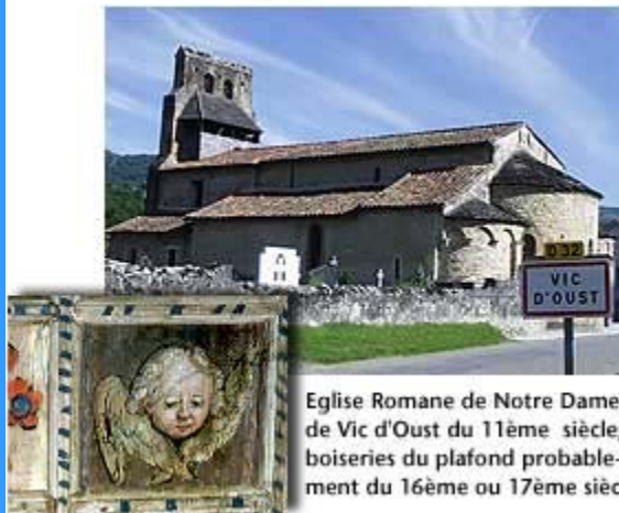
Eglise Romane de Notre Dame de Vic d'Oust du 11ème siècle; boiseries du plafond probablement du 16ème ou 17ème siècle.

The Romans appreciated the plain of Oust ("Augusta")--several place names (Vic, Anilac...) testify to their presence.