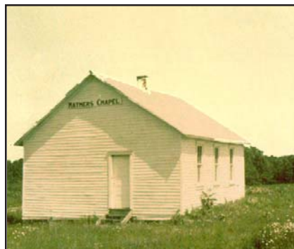
Mather's Chapel, undated photo.