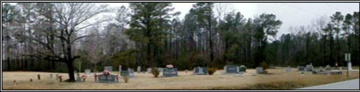
Figure 53 Gethsemane FWB Church Cemetery

When the US 70 bypass was built in the 1970s, the Bratcher Cemetery was incorporated in the Gethsemane church cemetery. The relocated graves were not marked except for two Stewart infant gravesites. The unmarked relocated graves are listed in the Bratcher Cemetery listing.