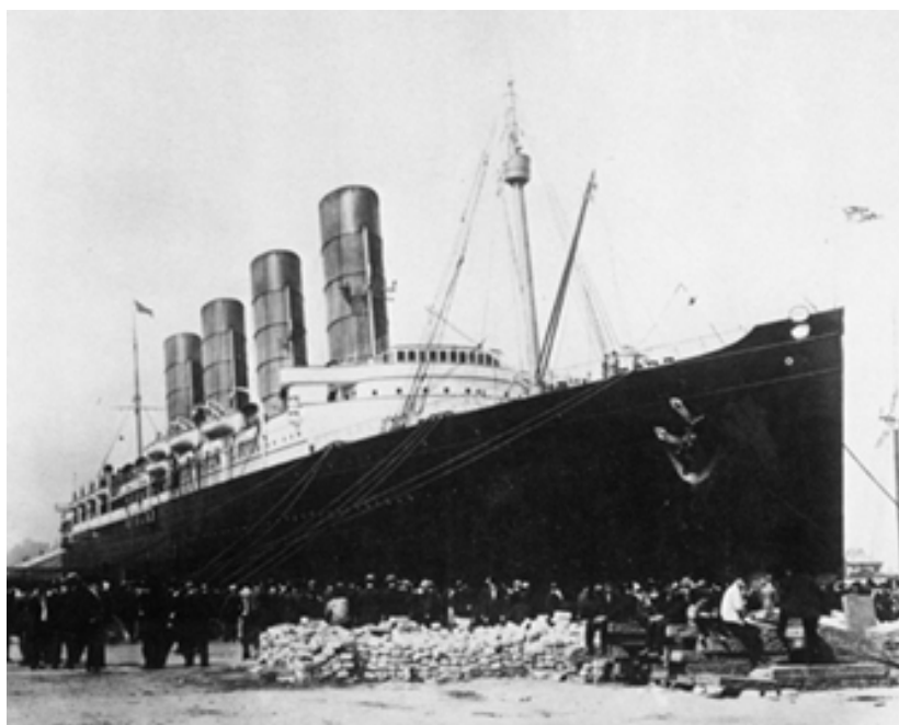
The SS Lusitania, a Cunard liner, which carried many Hollows to America. The ship was sunk without warning by a German submarine on 7 th May 1915. 1255 passengers and 651 crew were lost.