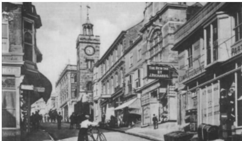
Fore Street, Redruth, 1904 from Redruth, the Archive photographs Series.