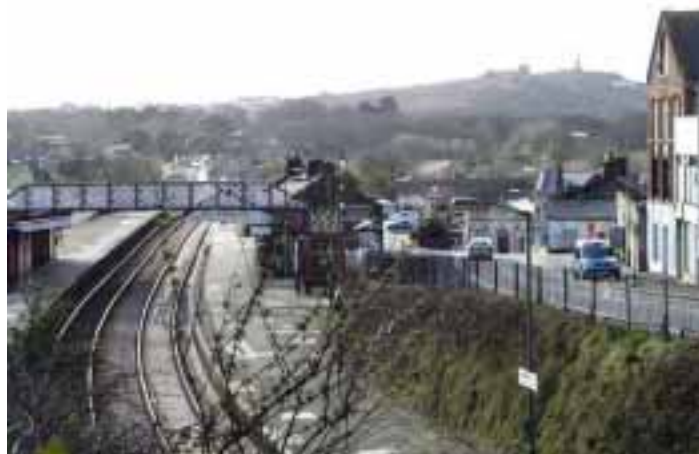
Redruth Station with Carn Brea in the background, the last view of Redruth most immigrants would see.