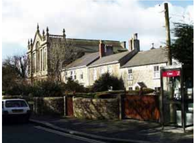
Plain an Gwarry, Redruth