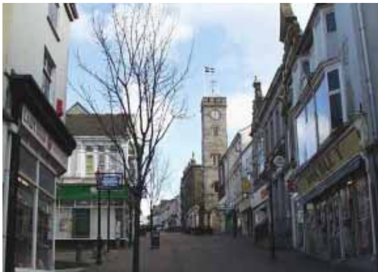
Fore Street, Redruth 2003 .....Photo: Keith Hollow

iii. Henry HOLLOW , b. 1 December 1835, Redruth, CON; d. 29