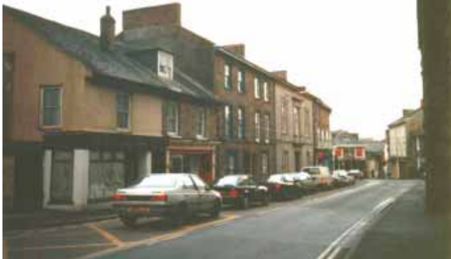
Penryn Street, Redruth.

Moonta, S.A., AUS; b. 1839, Farnham, Hampshire, ENG; d. 30 May 1903, Elsterwick, VIC, AUS.