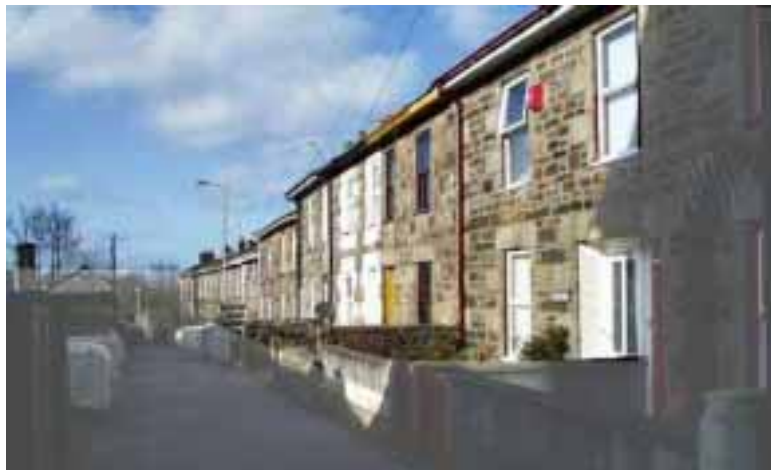
Hoskings Row, Redruth.....