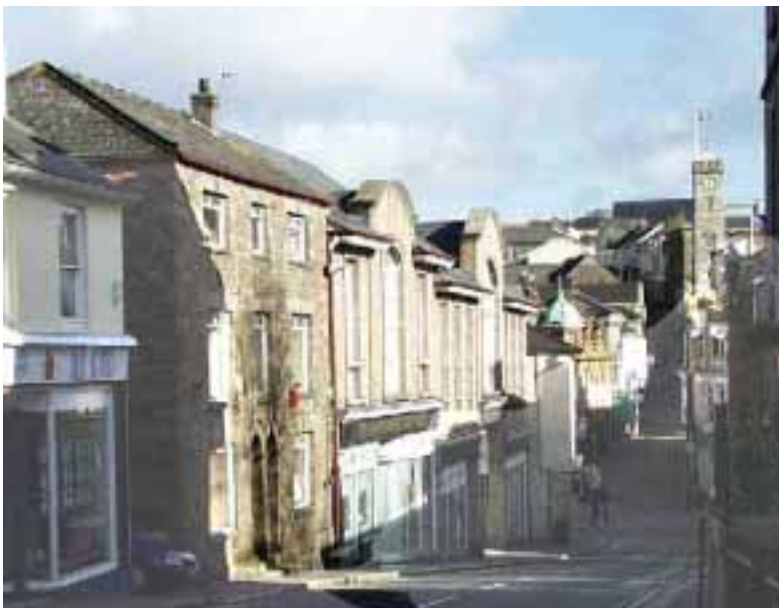
West End looking towards Fore Street