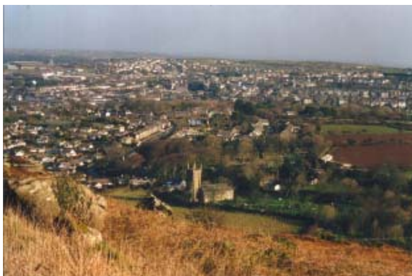
Redruth from Carn Brea.

St Euny's Church is in the foreground; it is almost a mile from the "Town", in the background.