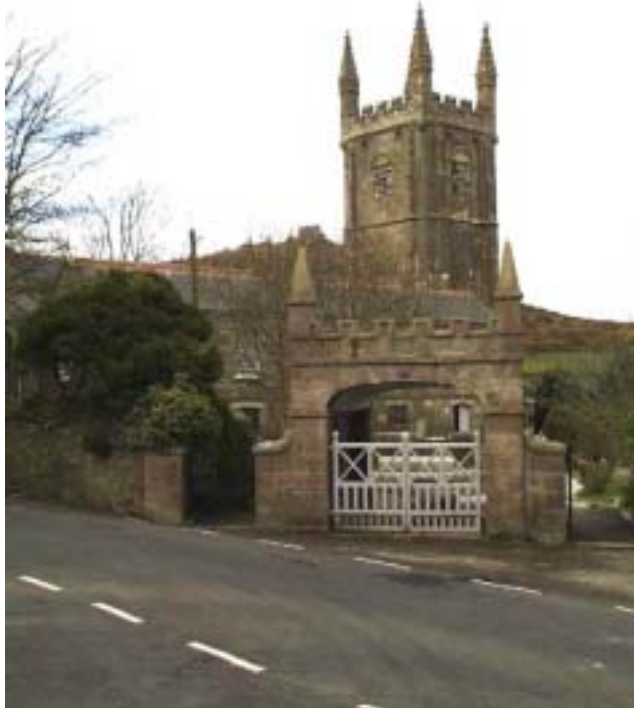
St Euny Church, Redruth