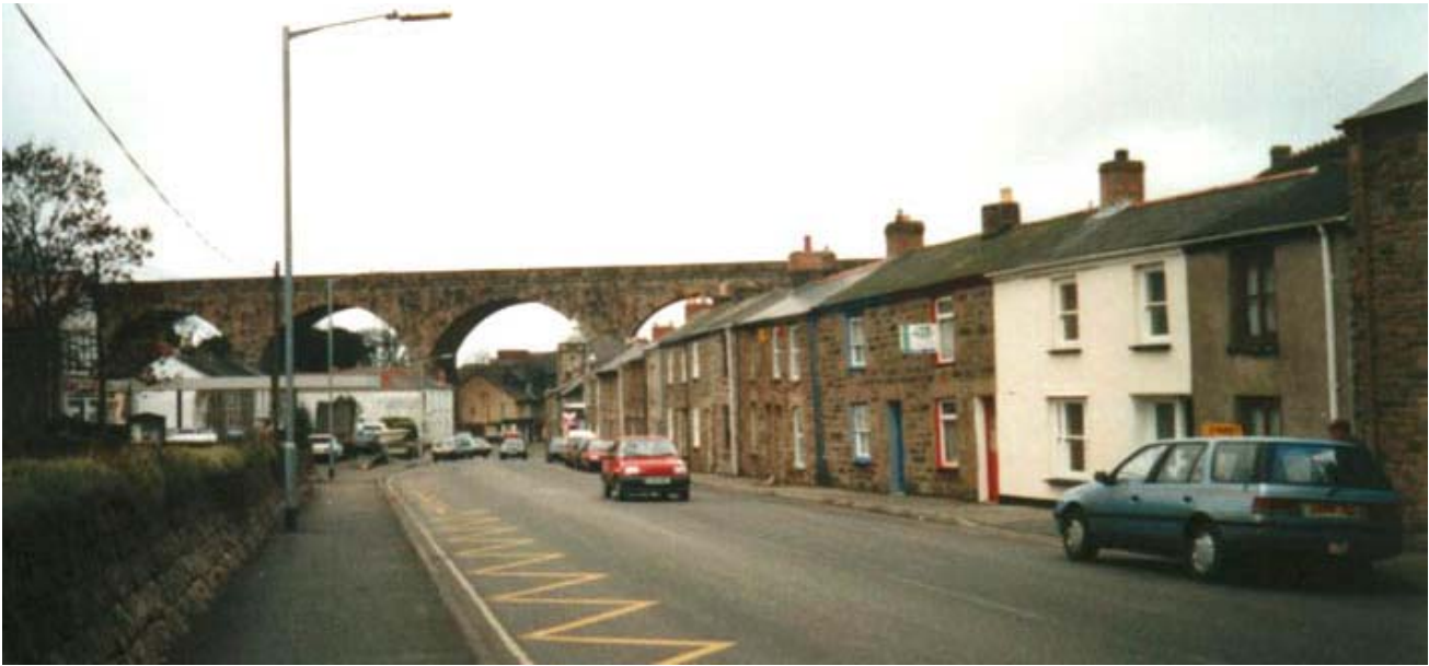
Bullers Row, now Falmouth Road looking back to the railway viaduct.